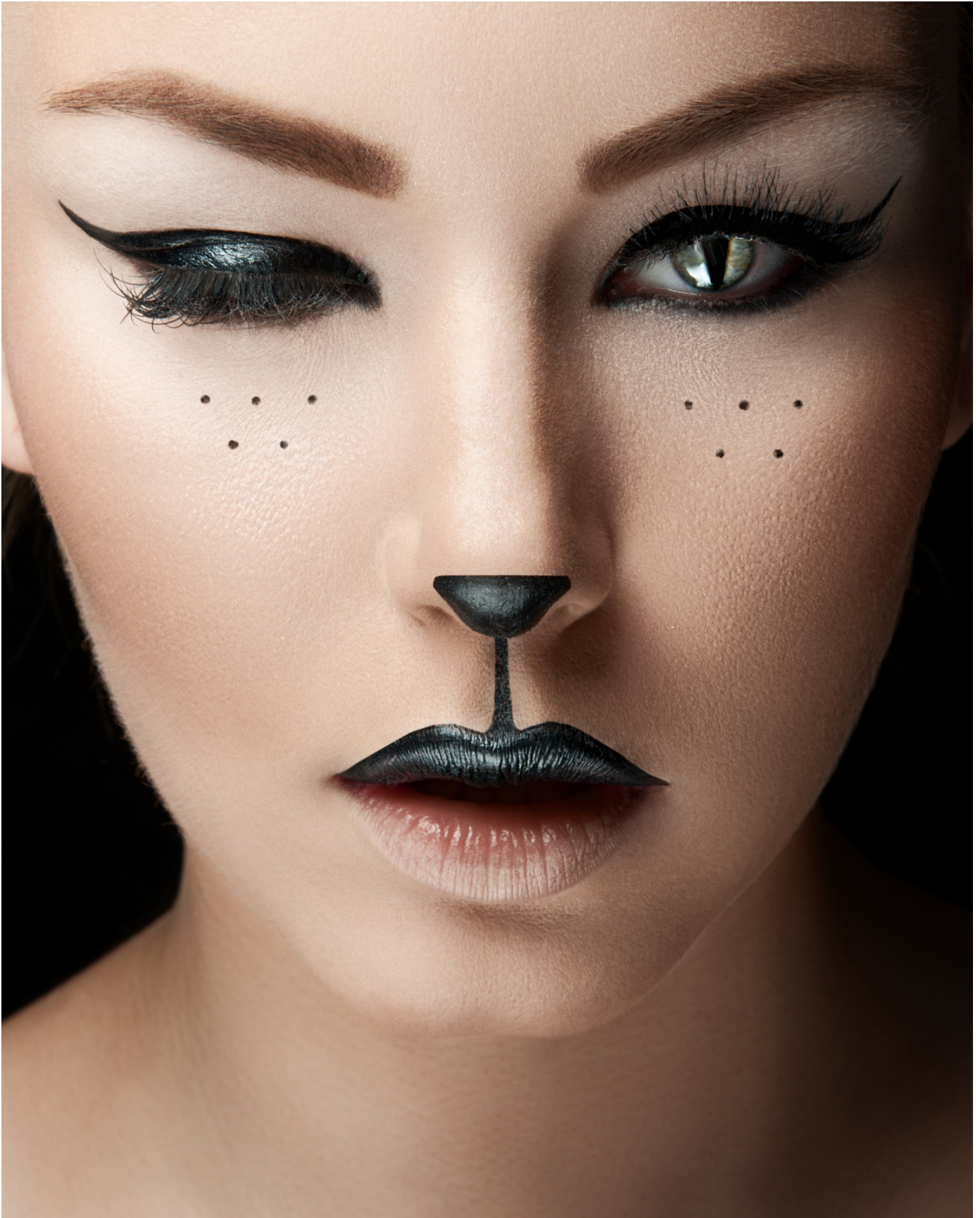
MODEL: Ewelina Koziejowska MUA: Rebeka Sobolewska