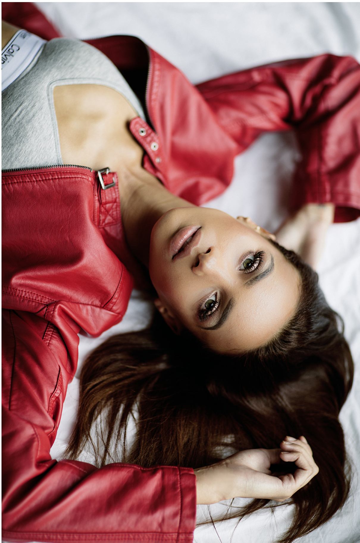
Makeup By Bouchra