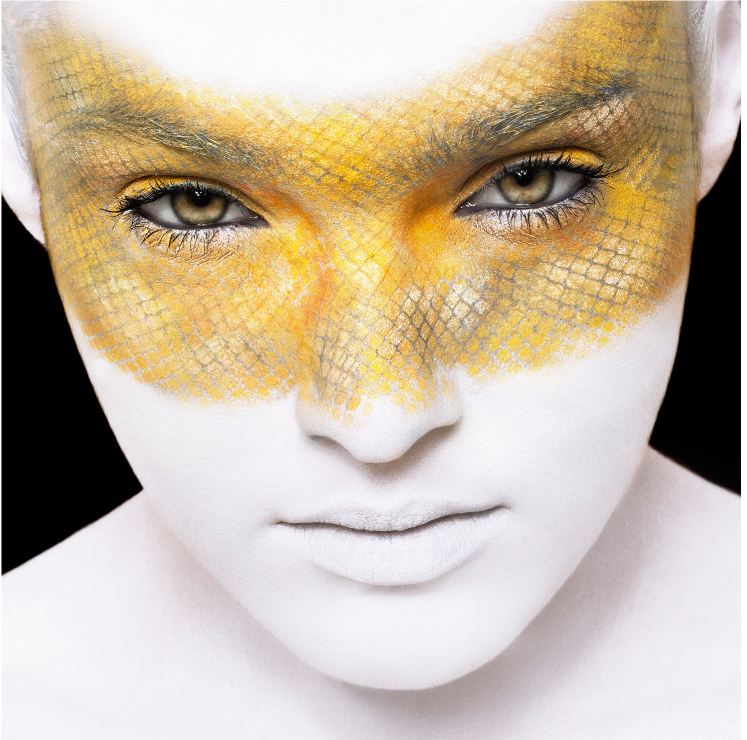
model: Olga Shutieva Makeup: Lara Quercioli Lacciarini